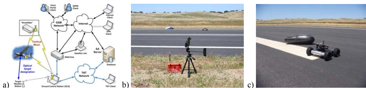
Fig. 4. Network architecture (a), optional ground weather station (b) and example of a ground robot deployment (c).

the coordinates of the delivery point itself, but also provides a very cheap and yet effective way of increasing accuracy of payload delivery by measuring and transmitting the ground winds. This palm-size device needs to be mounted at the desired target location, and may be deployed either with a vane, if a soft landing is needed, regardless the delivery direction, or without it, if a certain delivery direction is preferable (in the mountains). Day or night the requested payload will be delivered right to the target. Figure 4c shows an example of delivering a ground robot that proceeds with its own mission using an extended link via unmanned platform above it.