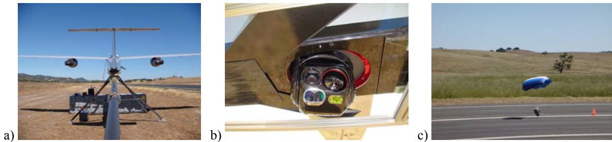
Fig. 3. Deployment platform (a) equipped with a gimbaled camera (b), designed for accurate payload delivery (c).

(Fig.3b) to find and track targets and capable of carrying up to 30 kilogram of payload (in two containers under its wing). Once the intended point of impact is chosen a parafoil-based delivery system is deployed. These systems implement the best guidance and control algorithms resulting in a pin-point accuracy of delivery (Fig.3c).