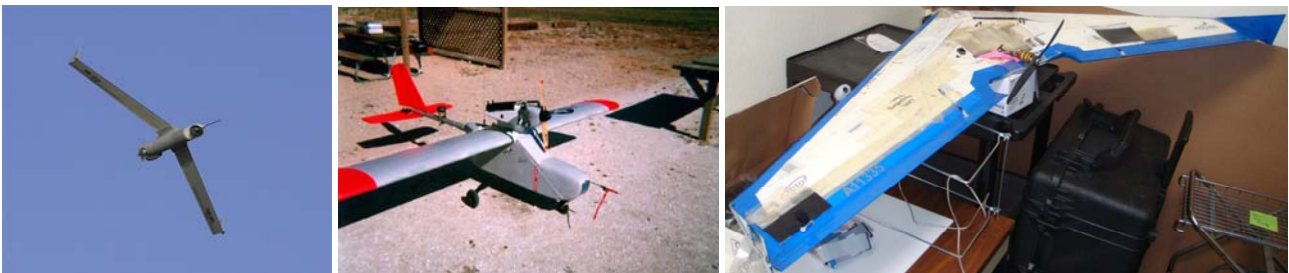
Fig. 1. A range of different aerial research platforms at NPS.

Among others, a lot of experiments involve different aerial platforms. Figures 1 and 2a show just a few aerial platforms used in a variety of research projects and Fig.2b demonstrates an extent of the experimental efforts during a typical field experimentation week.