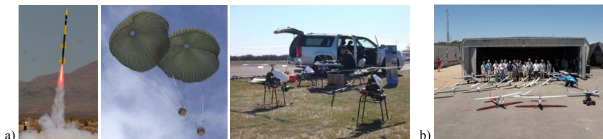
Fig. 2. Some other platforms (a) and a fleet of vehicles involved in a typical field experiment at Camp Roberts (b).