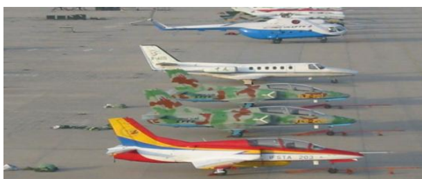
Fig. 2 CFTE Air Fleet