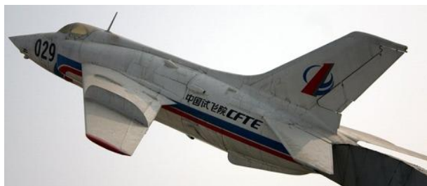
Fig. 1 CFTE Logo