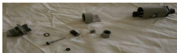
Fig. 7 YCG-B under Breakdown Check

Performance test and breakdown check of the products are carried out in the test. The Fig. 6 and Fig. 7 show the tests of YCG-B performance test and the breakdown check, and