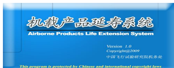
Fig. 5 Airborne Products Life Extension System

We developed a service life estimating system for airborne products on the basis of Wei-bull distribution (See Fig. 5).