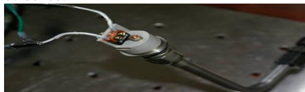
Fig. 6 YCG-B under Performance Test

To evaluate the airborne product life extending through certain lab tests is another frequently-used method. This method is very persuasive and of low risk because it has test data as the evidence.