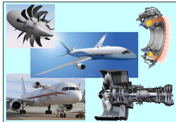
Fig. 3: Sampling of CLEEN Technologies

This year the FAA awarded five-year agreements to Boeing, General Electric, Honeywell, Pratt & Whitney and Rolls-Royce. These companies will match or exceed all Federal dollars in this cost-sharing program. The total Federal investment is expected to be $125 million, making the total expected overall value of efforts at least $250 million.