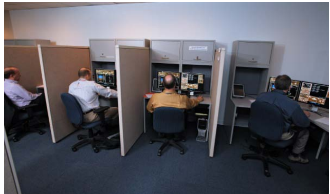
Fig. 2 Desktop pilot workstations in the NASA Langley Air Traffic Operations Lab.

The self-separation experiment was conducted in the Air Traffic Operations Lab (ATOL) at the NASA Langley Research Center, in Hampton, Virginia. This facility specializes in simulation-based research and development of advanced operational concepts employing ADS-B, but is suitable for a variety of operations research. For conducting batch and HITL experiments, it has over 300 computers, including 12 desktop pilot workstations, four of which are shown in Fig. 2.