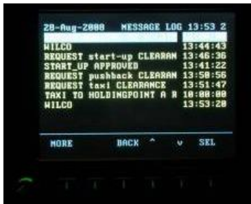
Fig. 1: Airworthy CDTI, modified for TAXI-CPDLC use

The CDTI is a commercial multi-functional display system manufactured by Funkwerk-Avionics, which can be used for visualisation of