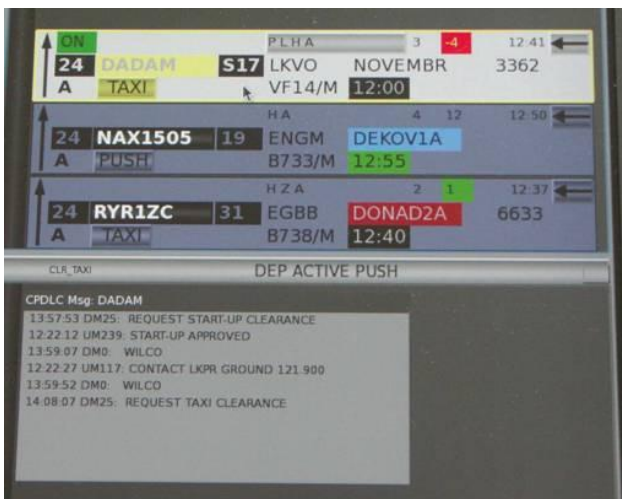
Fig.3: Electronic Flight Strips (EFS) and Message Window for DLR test aircraft D-ADAM, CPDLC is “on”

Due to the fact that Prague-Ruzyně and Milano-Malpensa did not have a CPDLC implementation in the approach centre, no transfer of communication from Approach to Tower could be performed. As a consequence, only a local ATN implementation at the airport, without ground-to-ground routing between Approach and Tower was there.