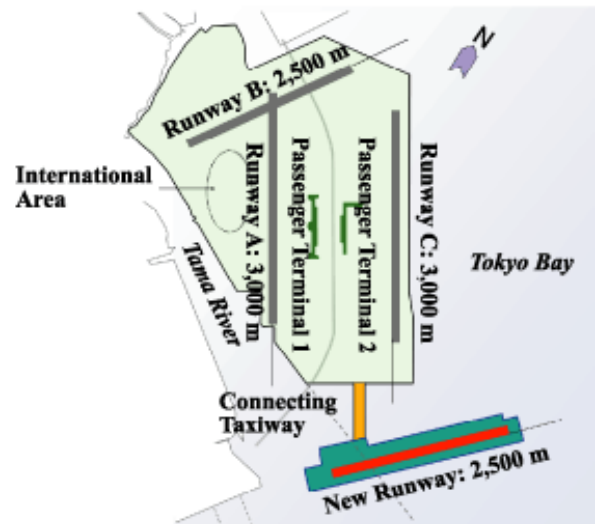
Fig.3 Haneda Airport Runway Layout (JCAB)[1]

be installed on the southern seaboard of the present airport. If the construction progresses as planned, it will be opened in 2009.