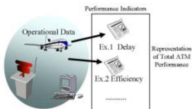
Fig. 7 ATM Performance Measures

Performance in ATM is very important for designing the ATM system since the purpose of ATM is safe and efficient movement of aircraft in the airspace. However, it is not clear what indicators should be used for evaluating the performance of ATM. In Europe, there is a body to look at the performance annually [6]. However, in Japan, the solid mechanism to comprehensively evaluate the performance of ATM is not established yet. The ENRI will start the study program on this subject from Fiscal 2007.