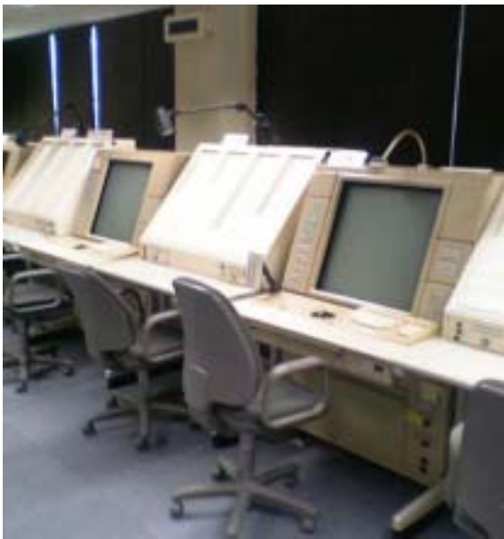
Fig.7 ATC simulator consoles at ENRI.

Some experiments using a real time ATC simulator will play an important role to validate or estimate the capacity of adjacent airspace to the terminal area. Real time simulations are core tools in this field of R&D. In addition to the real time simulation, fast time simulation will be made depending on the nature of the problems to be solved.