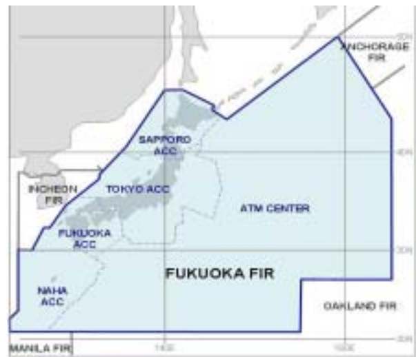
Fig.1 The FIR of Japan (JCAB).

In Japan, the Civil Aviation Bureau (JCAB), Ministry of Land, Infrastructure and Transport (MLIT) is responsible for the services mentioned above. Fig.1 shows the flight information region (FIR) under the Japanese authority. There are four area control centers at Sapporo, Tokyo, Fukuoka and Naha. In October 2005, the air traffic management center (ATMC) was established at Fukuoka. It has been in operation since February 16, 2006.