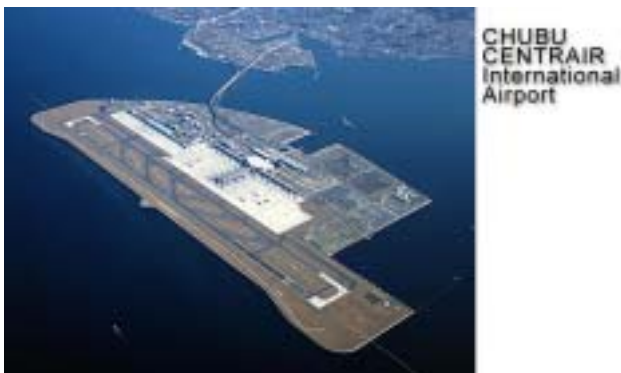
Fig.2 Bird's-eye View of Chubu Centrair Int'l Airport (JCAB) [1]

This new airport was opened on February 17, 2005 to meet the demand for air transport from industrial activities within the Chubu (Central Japan) region. This is a major industrial region with a population of about 20 millions. This region accounts for approximately 25% of the GDP in Japan.