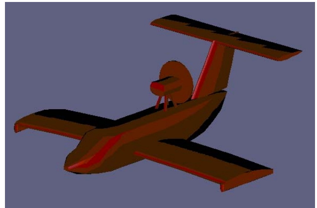
Fig.1 The small WISE transport vehicle

possesses lateral stability [2] and the lateral-directional motions are influenced only moderately by surface effect [3], the assessments of stability and flying qualities in this paper are concerned with longitudinal motions.