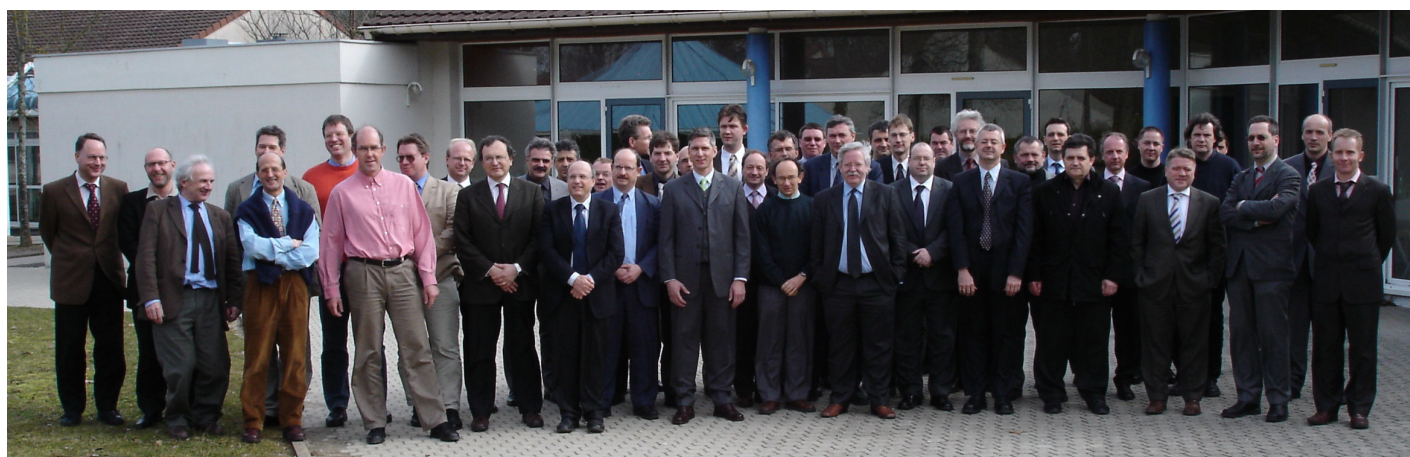
Fig.2: The workshop participants