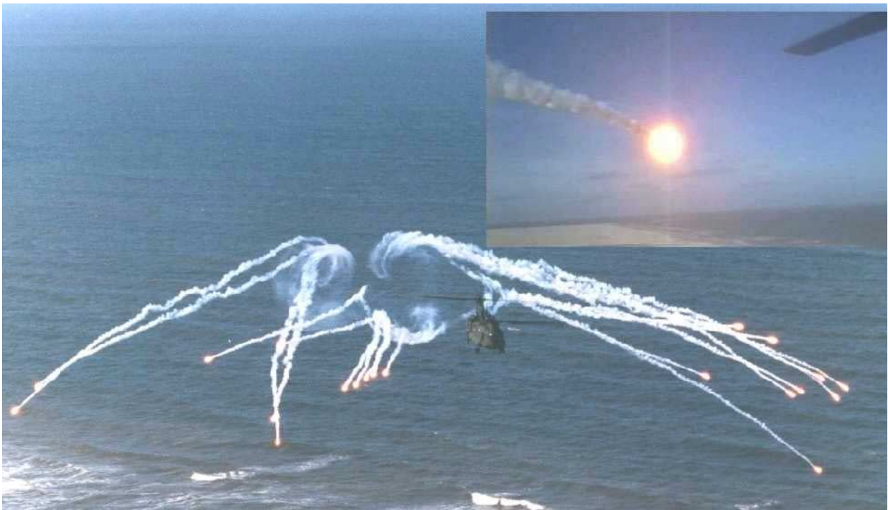
Fig. 2: Flare separation trials on RNLAF CH-47D Chinook