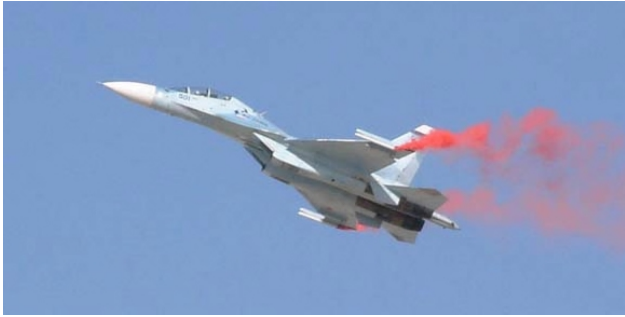
Fig. 3 Su-30MK at high angle of attack.