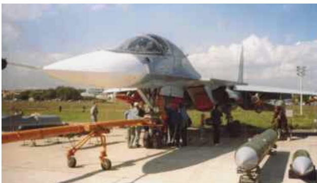
Fig. 6 Sharp-pointed nose of Su-32.