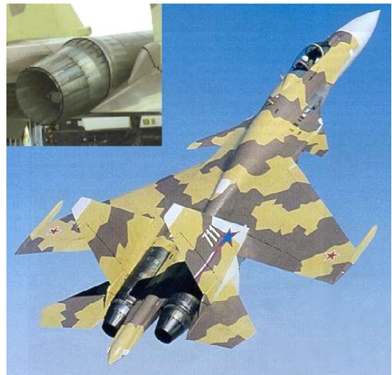
Fig. 8 Su-37(711) in flight and its deflecting nozzles.