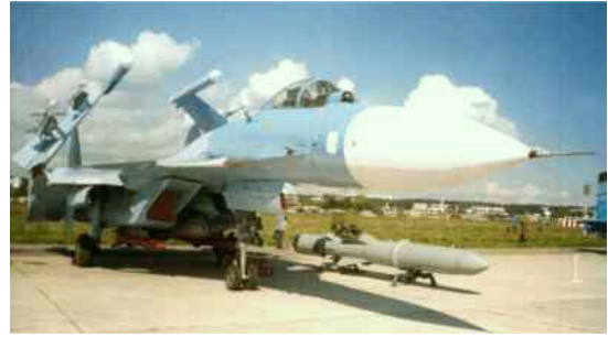
Fig. 7 Navy fighter Su-33K.