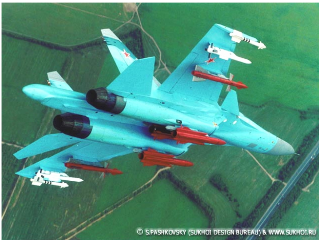
Fig. 5 Su-32 middle range bomber with weapons in flight.