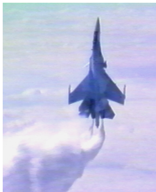
Fig. 2 Cobra maneuver at Su-33K.