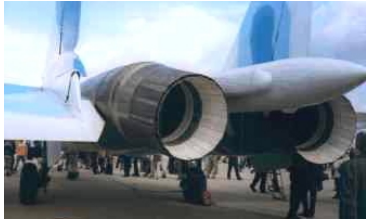
Fig. 4 Su-30MKI (top) and its deflecting nozzles.