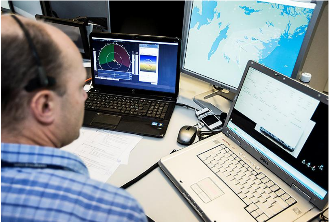
Fig. 1. An overview of the remote pilot work station.