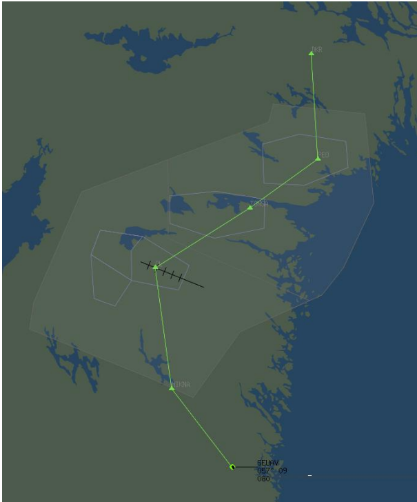
Fig. 4. Overview of the Östgöta TMA in the south of Sweden, and the RPA flightplan from south to north.

There were three active airports/CTRs under the TMA: