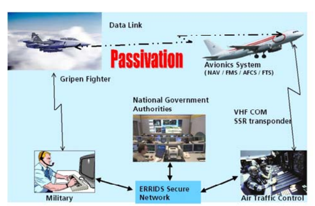
Figure 1: Integrated passivation concept by using the ERRIDS-System

The passivation concept is shown in Fig. 1. It makes use of the proposed ERRIDS (European Regional Renegade Information Dissemination System), which was developed as a prototype bv EUROCONTROL. ERRIDS is information dissemination system to be used by organisations involved in response to acts of unlawful interference or suspected acts on board an aircraft. The information that will be made available on a need-to-know basis will concern the flight, the route, the passengers and crew, the cargo, the alert state, threat assessment by states, the progress of the response by states and the handover information between states.