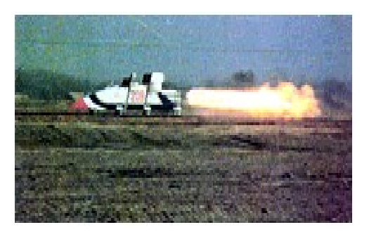
Fig4. High-precision Rocket-powered Slider Eject Test-bed

depend on the advanced devices and equipments, lots of results of the study have been applied in the development of Lifesaving products successful. The research using mathematicalinvolves: study dynamic simulate of comfortable of eject-seat; simulation of 9freedom dynamics model of Human-chair system; visualized analysis of Fluid-field during eject process; dynamic system model of Human-parachute; technology of automatic eject <sup>[21, 22]</sup>; etc. In the aspect of experimental study, the performance of full size eject-seat and the aerodynamic character of pilot-helmet for high capability aircraft ware tested using low speed wind tunnel in the R & D Center of Aerodynamic of China; many experimental devices such as the High-precision Rocketpowered Slider Test-bed (Fig.4); Vibratory test platform; Large test platform of horizontal impact; Joint test bed of eject power; and the equipments of light-remote testing <sup>[23, 24, 25]</sup>; etc. were built in the Institute of Aeronautical Lifesaving Equipment of China. These equipment conditions put a great progress of the technology of Life-support products in China.