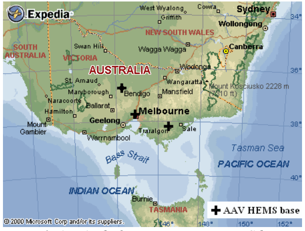
Fig. 1. Air Ambulance Victoria HEMS bases

Operational safety is a central concern in the HEMS industry; weather, night time flight, spatial disorientation from the lack of visual clues, pilot training and experience, and pressure to take the flight are all risks associated with HEMS operations [1, 5, 6, 9, 13-17]. Safely operating in this high risk environment calls for the systematic evaluation and management of the risks [13].