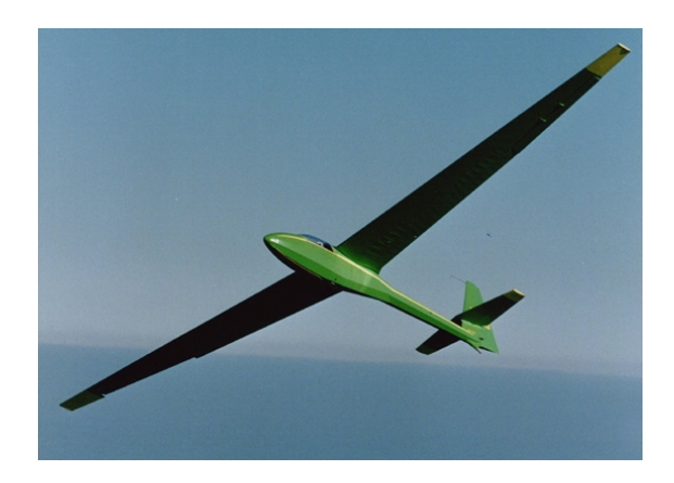
Fig. 1: EA-9 "Optimist" glider in flight, (single-seat, span 15.7m, maximum take-off mass 335kg), courtesy J. Edgley.